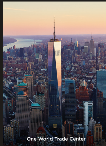
One World Trade Center