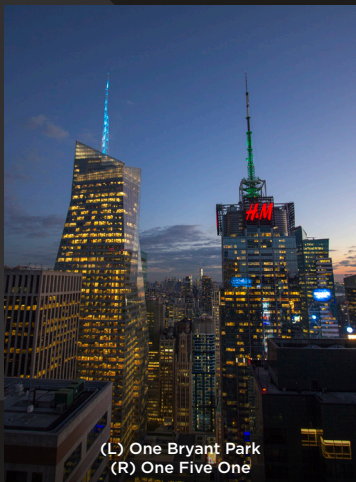
(L) One Bryant Park (R) One Five One

The Durst Organization owns and manages 13 million square feet of Class A office and retail space and over three million square feet of residential rental properties, with 2,500 apartments built and over 3,500 in the pipeline.