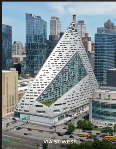
VIA 57 WEST