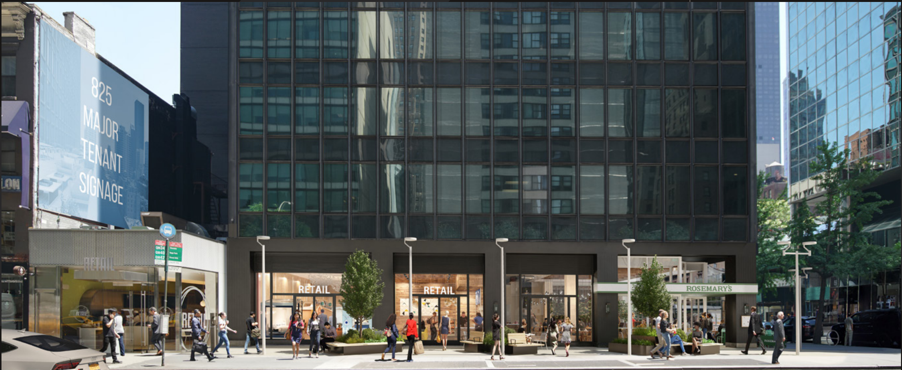
THIRD AVENUE — RETAIL