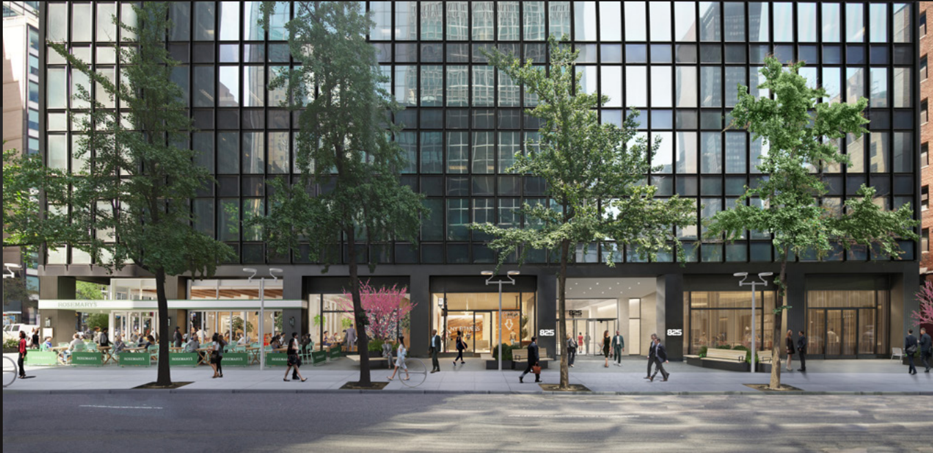
50 TH STREET RETAIL & BUILDING — ENTRANCE