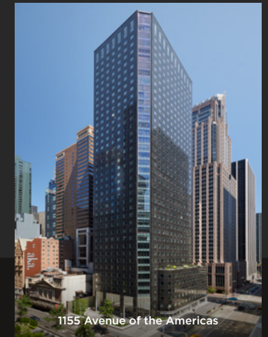
1155 Avenue of the Americas