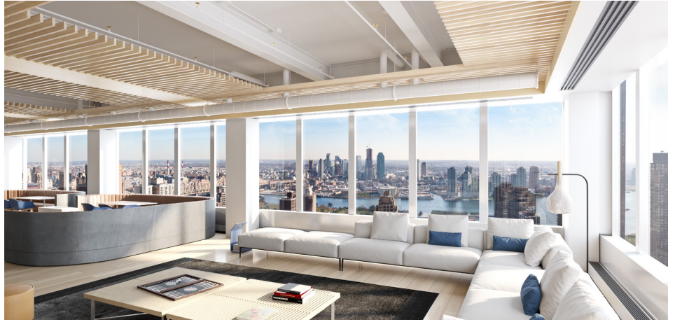
TOP OF HOUSE LOUNGE