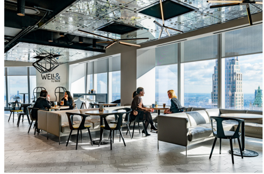
WELL & BY DURST AMENITY SPACE