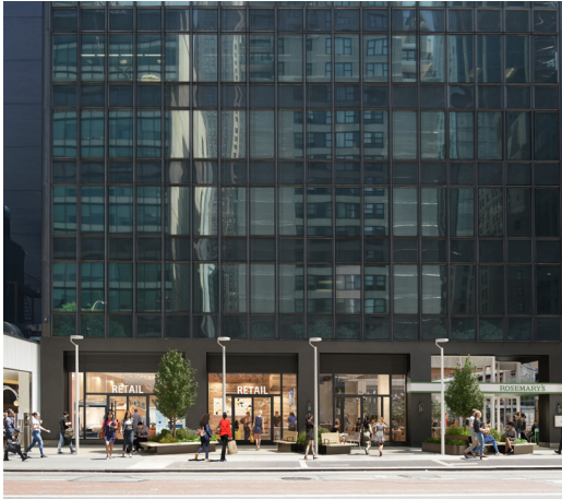
THIRD AVENUE RETAIL