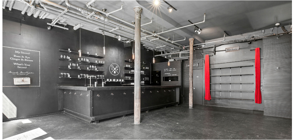
TURKEY BAR INSTALLATION