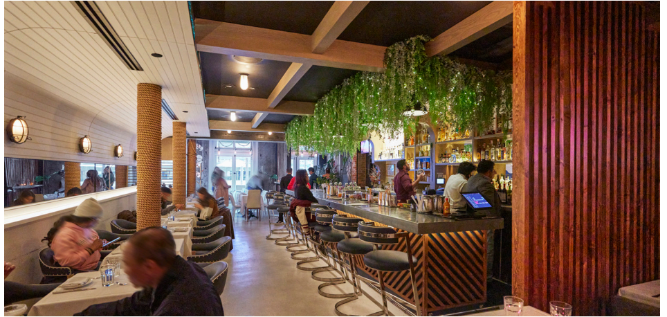
BAR & MAIN DINING*