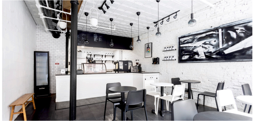
CAFÉ & SEATING AREA