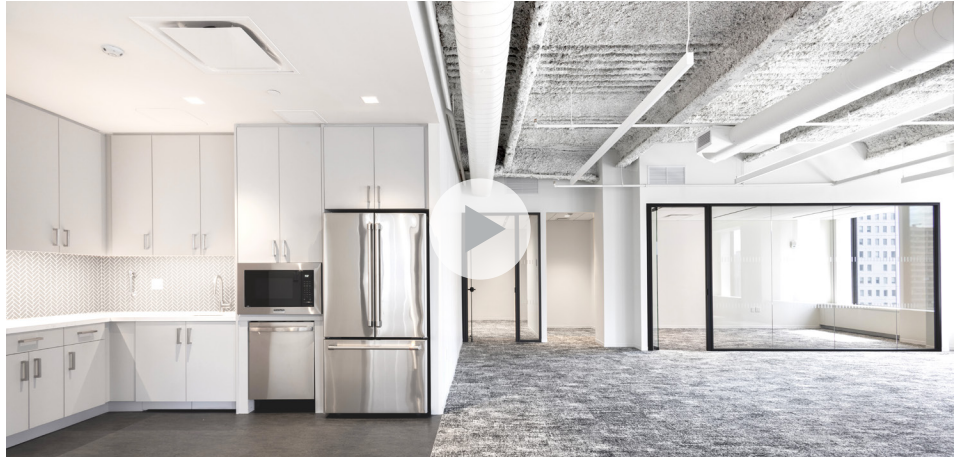
TAKE A VIRTUAL TOUR