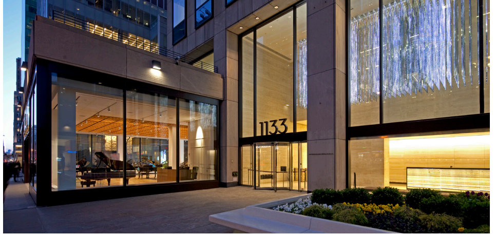
LANDSCAPED ENTRY PLAZA