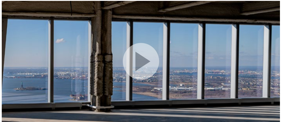
TAKE A VIRTUAL TOUR