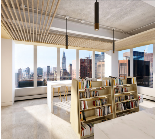
OPEN WORK LIBRARY