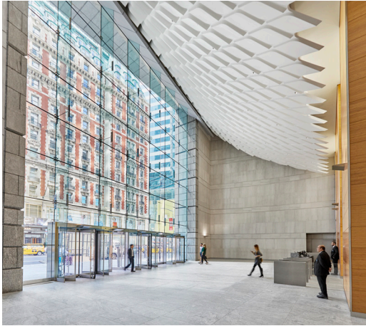
42 ND STREET LOBBY