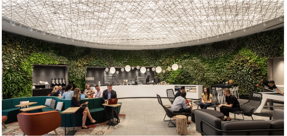
WELL& BY DURST - THE GREEN