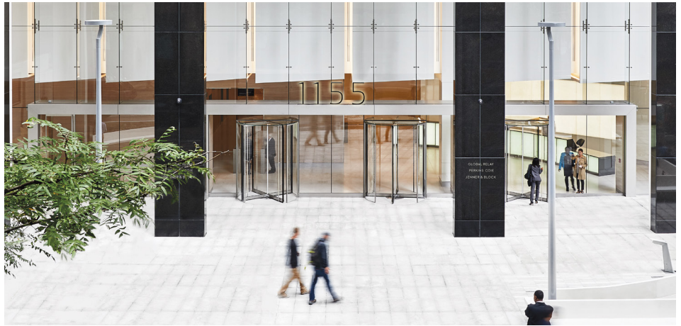
PLAZA & ENTRANCE